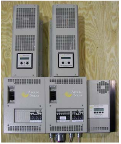
Parallel Stacking with T80HV