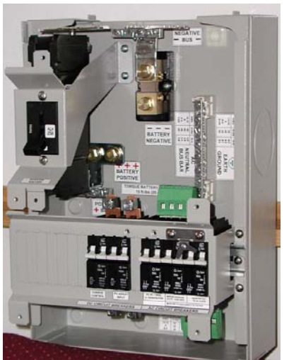
ISM 120/240 with cover removed